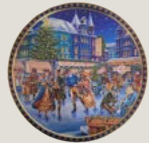
Jacobsens Skating Rink Butter Cookies Tin