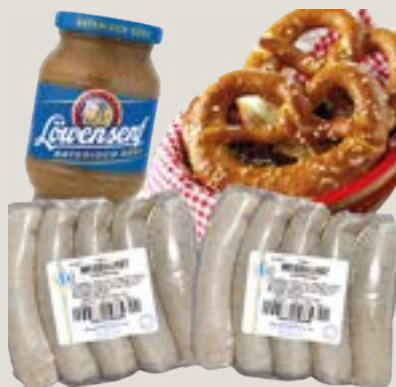
WEISSWURST & PRETZEL COLLECTION $48.95