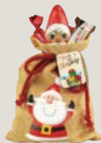
Windel Santa Jute Bag (assorted chocolates & figures)