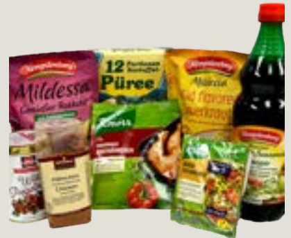
"BRATHENDL" ROASTED CHICKEN MEAL KIT $27.50