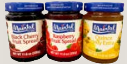
MAINTAL "BLACK-RED- GOLDEN" PREMIUM FRUIT PRESERVES, 3 PACK $15.00