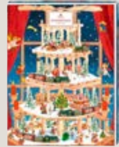
Niederegger "Christmas Pyramide" Advent Calendar