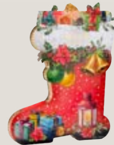
Heilemann "St. Nicholas Boot" Deluxe Praline Advent Calendar