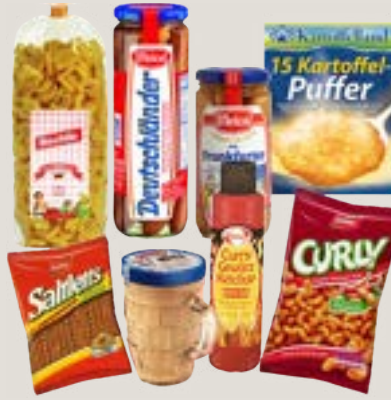
GERMAN GAME DAY SAMPLER, 6 PC. $45.95 (free shipping)