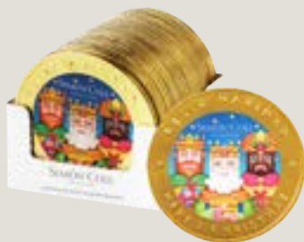
Simón Coll Three Kings Day Chocolate Medallions