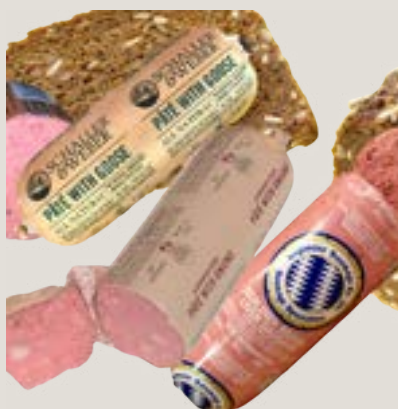
LIVERWURST SPREAD & WHOLE GRAIN BREAD MEAL KIT $25.00