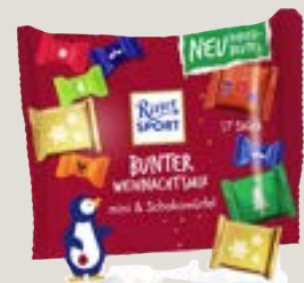
Ritter Sport "Colorful Christmas Mix" Winter Chocolate Cubes