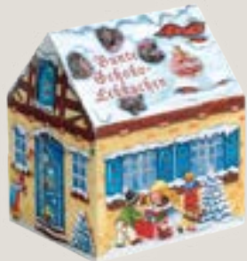
Chocolate Gingerbread and Sprinkles in Winter House Box