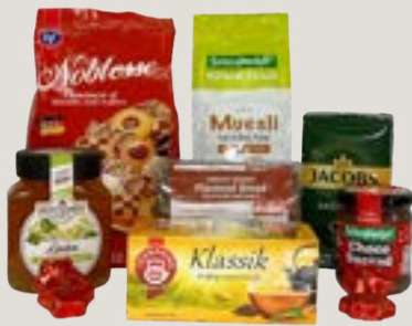
GERMAN BREAKFAST IN BED COLLECTION, 9PC. $45.95 (free shipping)