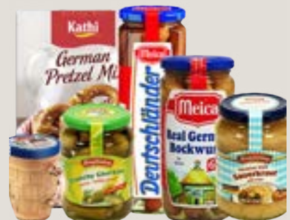
FOOD COLLECTION (MEDIUM SIZE) $45.95