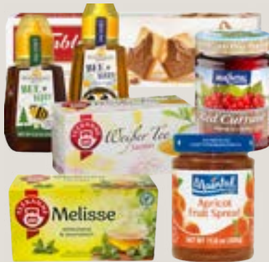
HONEY JAM TEA COLLECTION, 7PC. $49.95 (free shipping)