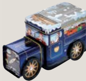
Haeberlein Metzger "Nostalgic Truck" Tin