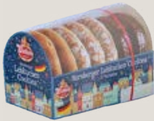
Oblaten Lebkuchen Assorted 14% Nuts