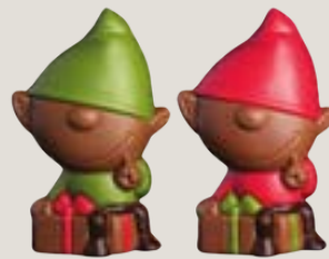
Weibler Milk Chocolate Elves, 2 large pc