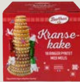
Nidar "Bertha's Kransekake" Wreath Cake