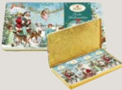
Heidel "Christmas Angels" Milk Chocolate Deco Tin