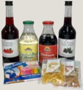
THE DRINK MIXERS COLLECTION $45.95